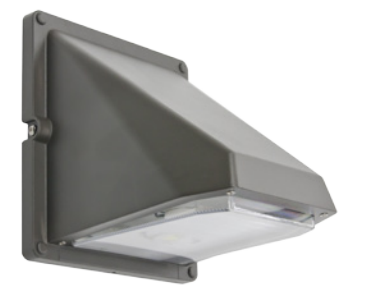
WP-LP-50-DB Medium Profile Wall Pack 14W / 740Lm